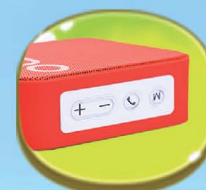
Mic / FM