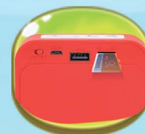
U-disk / TF